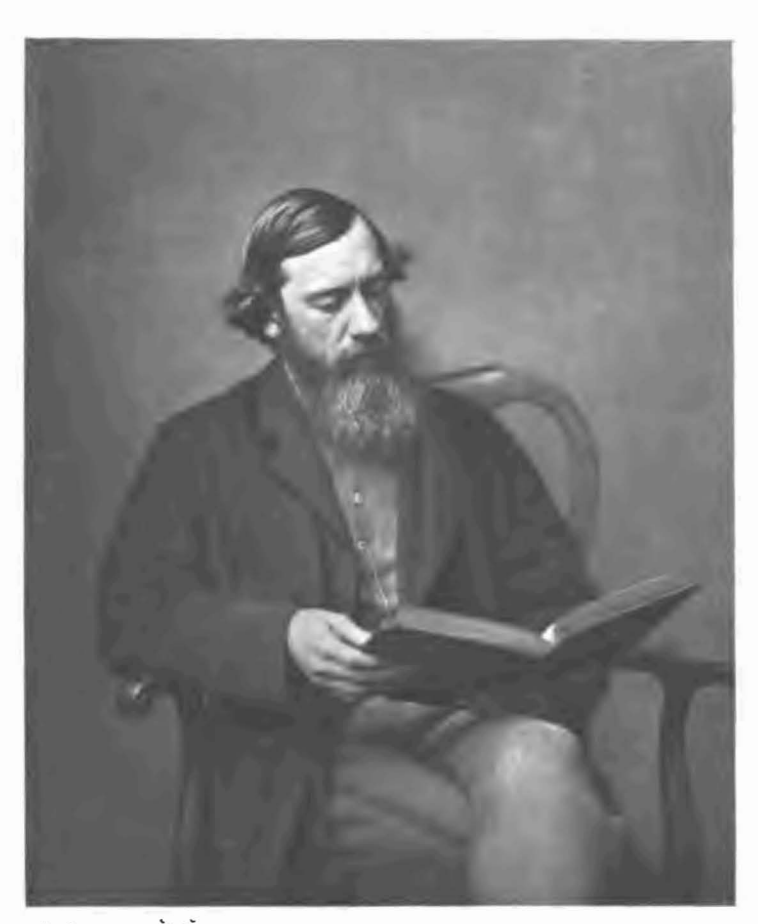
Moncure D. Conway