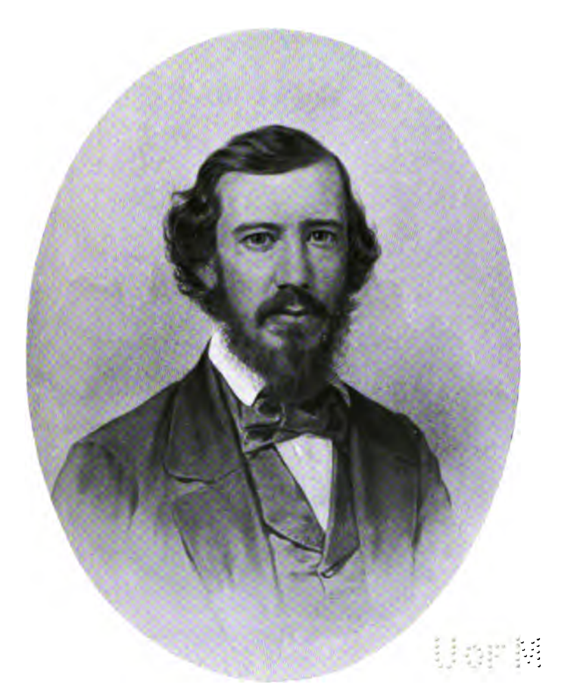
MONCURE D. CONWAY