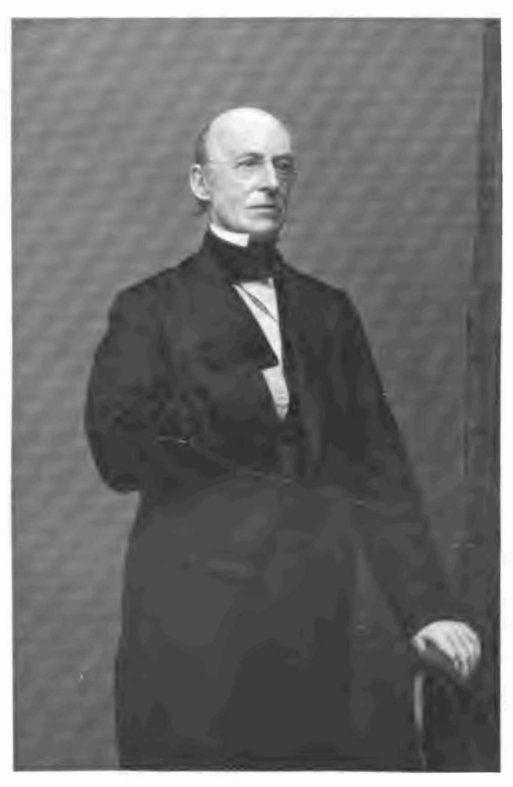
WILLIAM LLOYD GARRISON