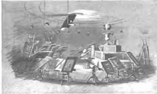
THE LOWELL DRAWING-SCHOOL ROOM In Marlboro Chapel