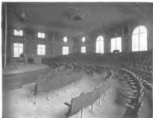
HUNTINGTON HALL Rogers Building