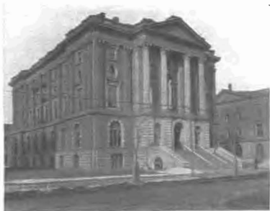
ROGERS BUILDING Massachusetts Institute of Technology