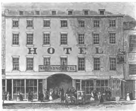
MARLBORO HOTEL Showing passageway to the Marlboro Chapel