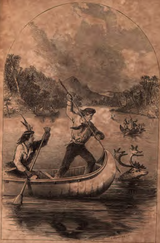
SPEARING DEER IN THE FAR NORTH.