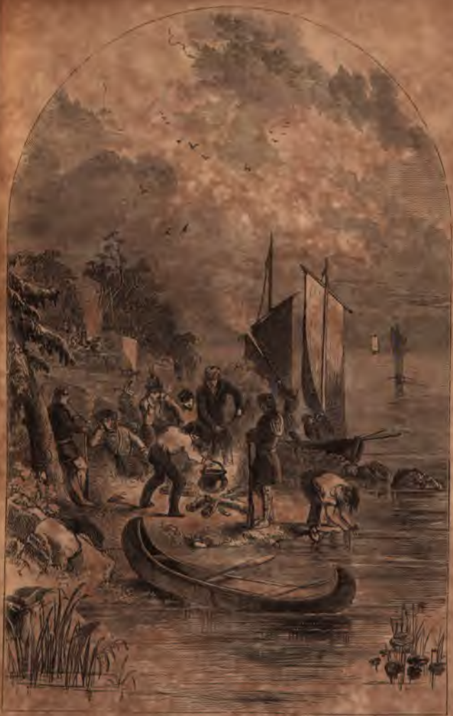
ASHORE FOR BREAKFAST.