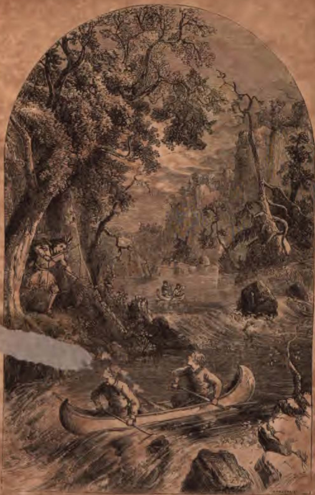
A TIVING SHOT.