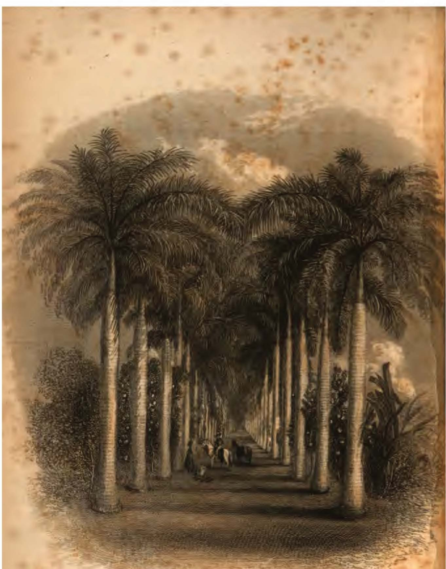
PALM AVENUE IN A COFFEE PLANTATION, CUBA.

Engr. by J. Wilson from an original Painting by V. C. Audubon.