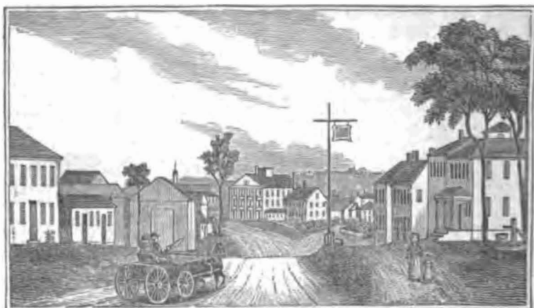
South-eastern view of Hubbardston.

The above is a south-eastern view in the central part of Hubbardston, showing the two hotels, and some other buildings in the vicinity. The village, which consists of two churches and about 50 dwelling-houses, has a flourishing appearance.