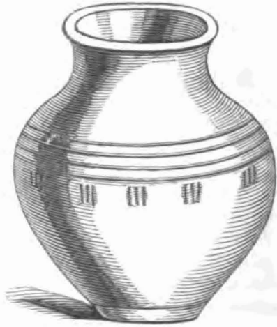
"A Roman Urn drawn with a coal taken out of it, and found among the burnt bones, and is now in the possession of Dr. Hans Sloane, to whom this plate is most humbly inscribed."—FIRST EDITION.