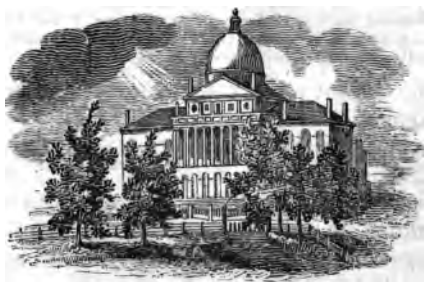
STATE HOUSE IN BOSTON.

Q. When and for what purpose was a monument erected at Lexington ?