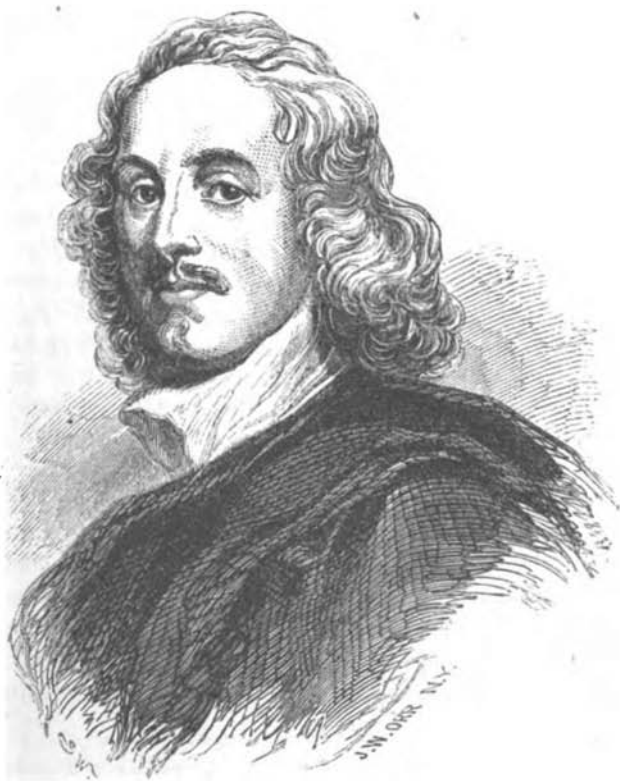
SIR HENRY VANE.