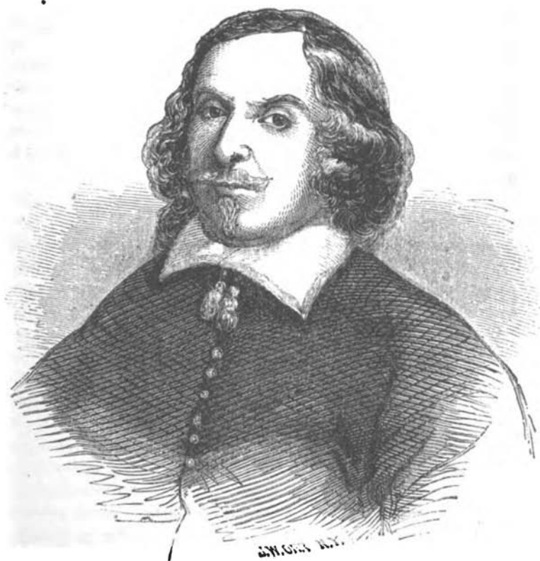
GOV. EDWARD WINSLOW.