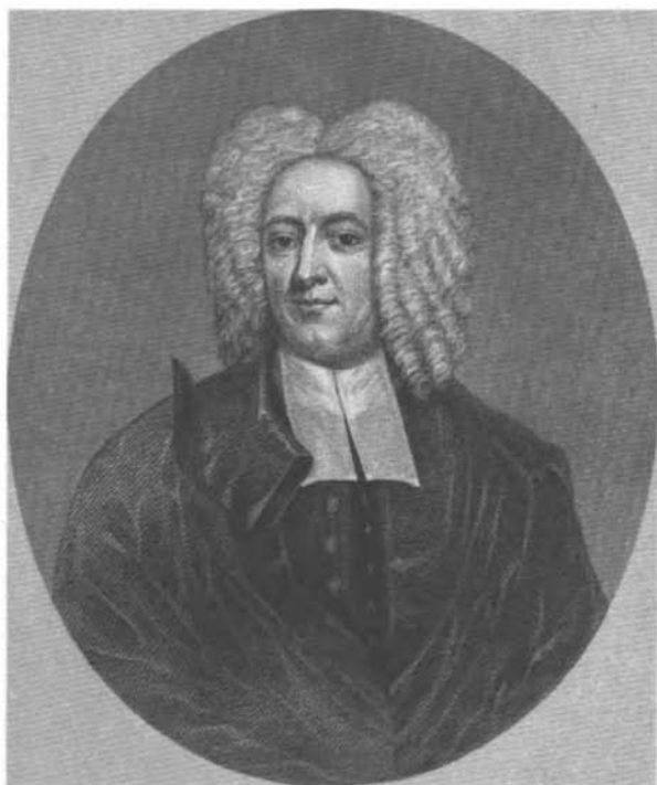
COTTON MATHER, D. D.