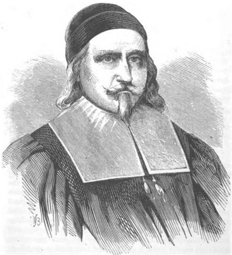
GOV. JOHN ENDICOTT, THE ORIGINAL GRANTEE OF MASSACHUSETTS.