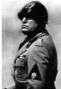
Il Duce (acting impressed)

Ezra Pound was granted an audience with the Italian swordsman Benito Mussolini and presented him with his digest of economic reforms and a draft of his CANTOS.